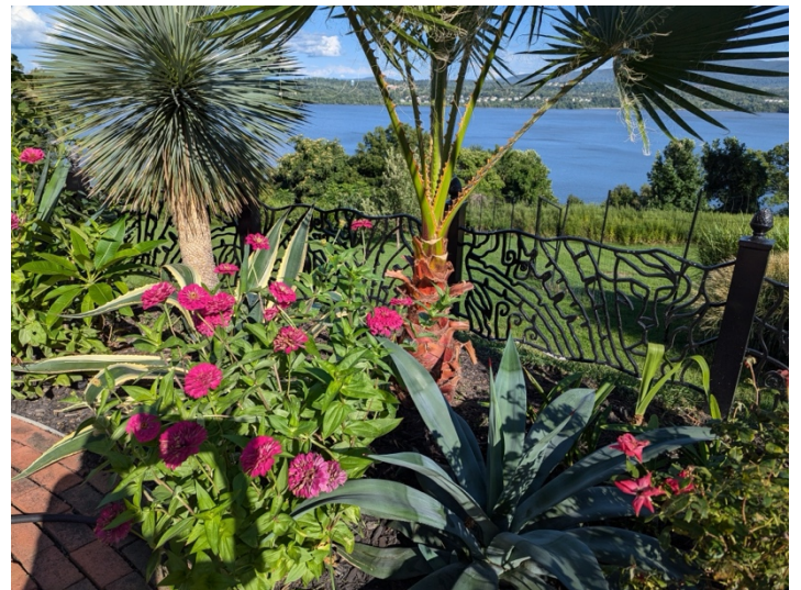
Private garden of Tim Covington, Newburgh, NY