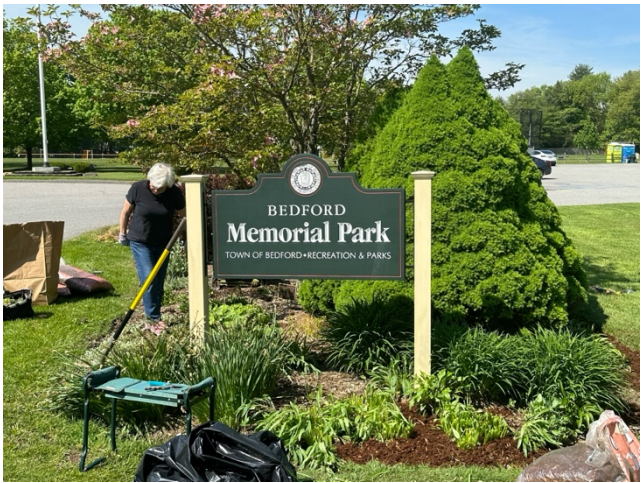
Hopp Ground GC Civic Beautification at Bedford Memorial