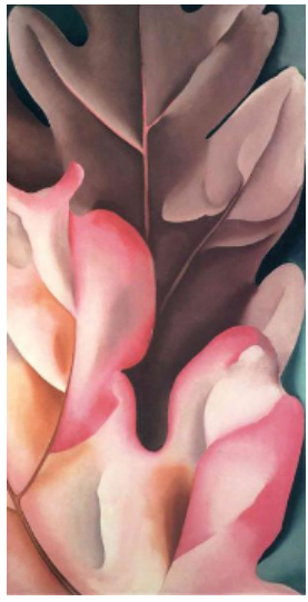
Class 5. "Oak Leaves, Pink and Gray" (1927) Functional Table for Dinner for Two