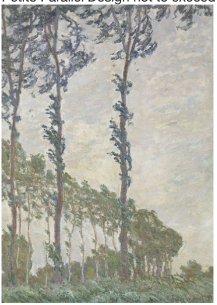
Class 9. "The Poplars" (1891) Petite Parallel Design not to exceed 8"