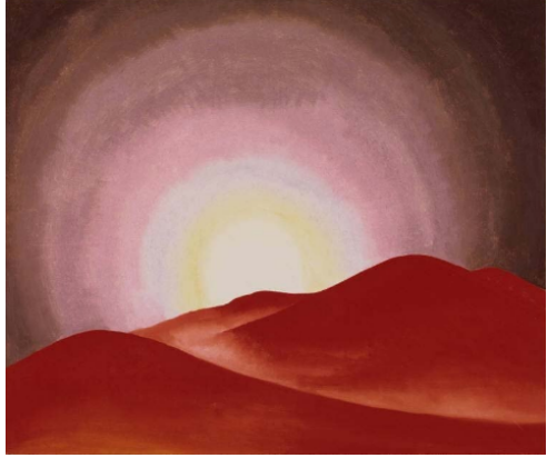
Class 6. "Red Hills, Lake George" (1927) Breakfast Tray for One